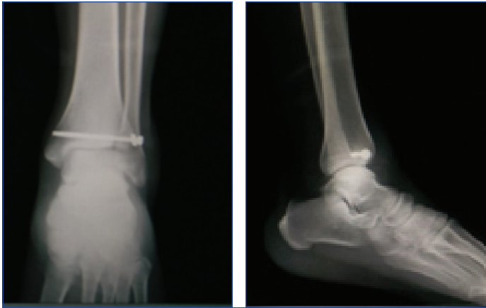
[Table/Fig-4]: One-year-old follow-up AP view of fixed Chaput tubercle fracture.